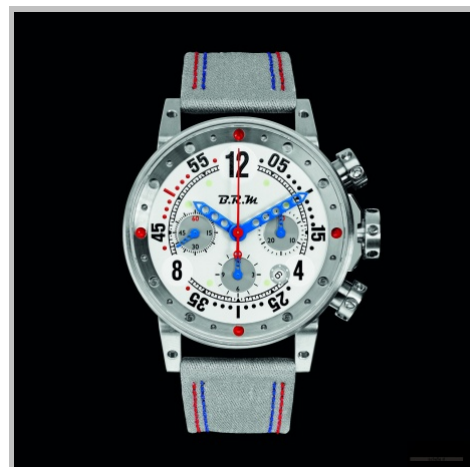
V12-44 Stand 21 Watch by B.R.M. Chronographes